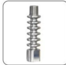
R3 High-Temperature tube