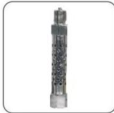
R2 Capillary radiator