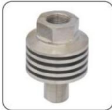
R1 High pressure radiator