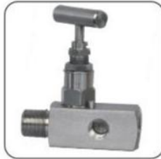
One Valves With A Bleeding Screw